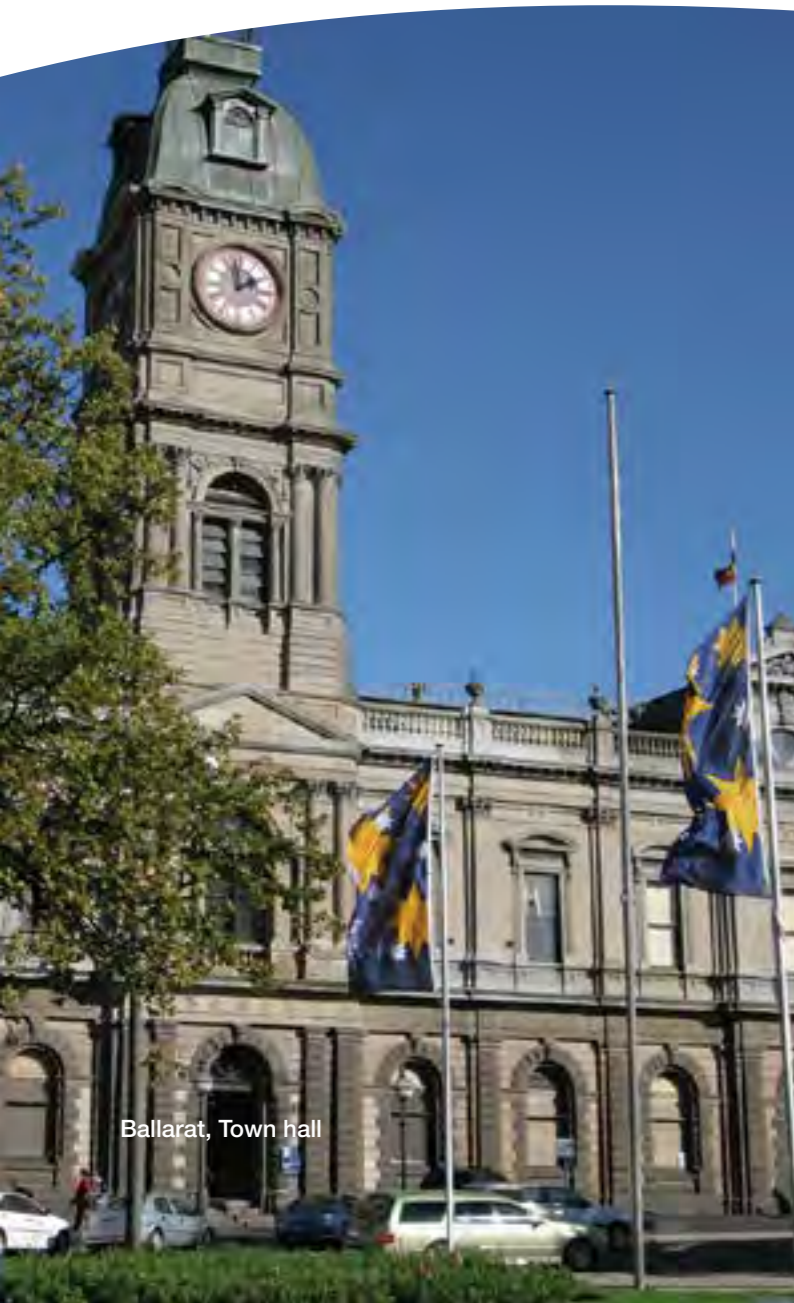
Ballarat, Town hall