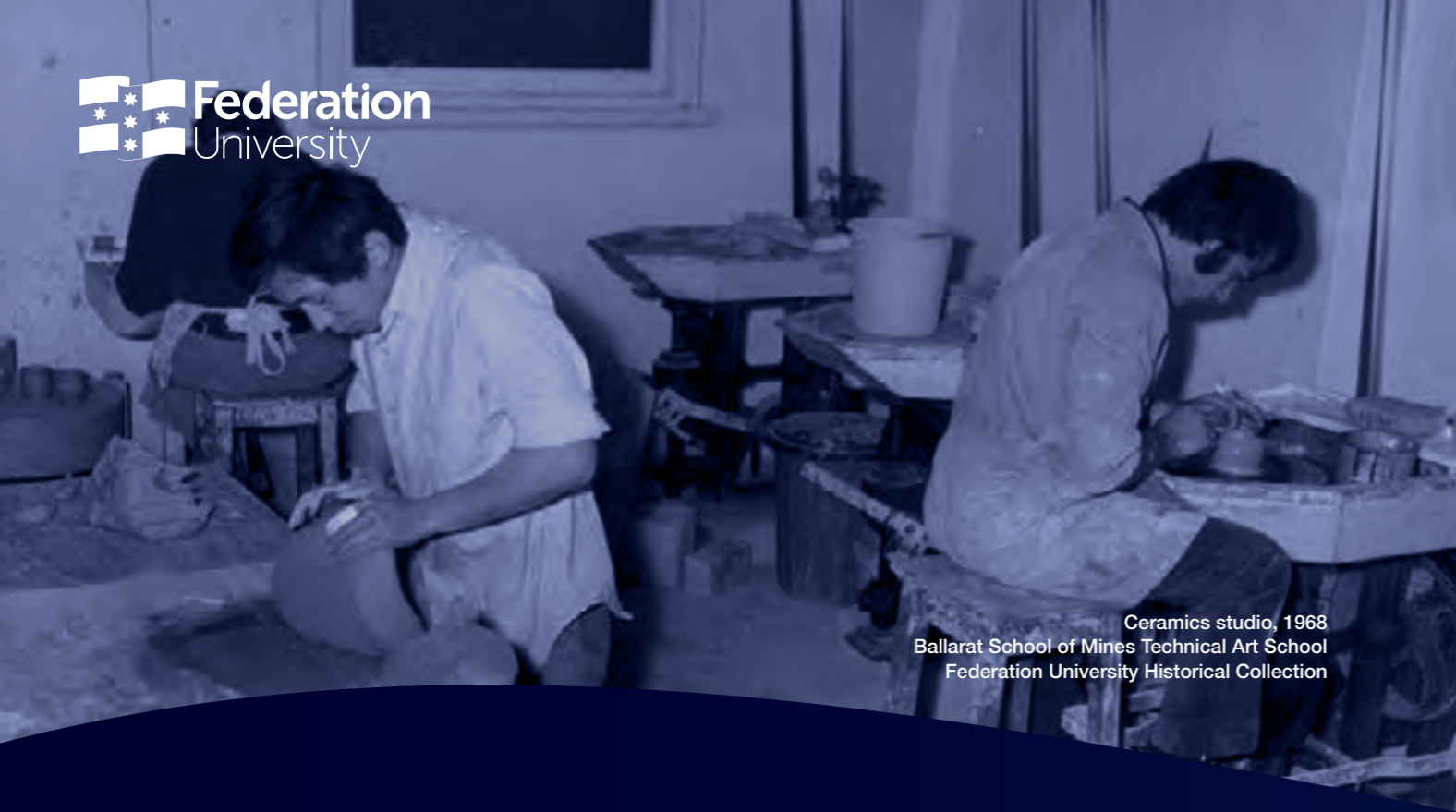
Ceramics studio, 1968 Ballarat School of Mines Technical Art School